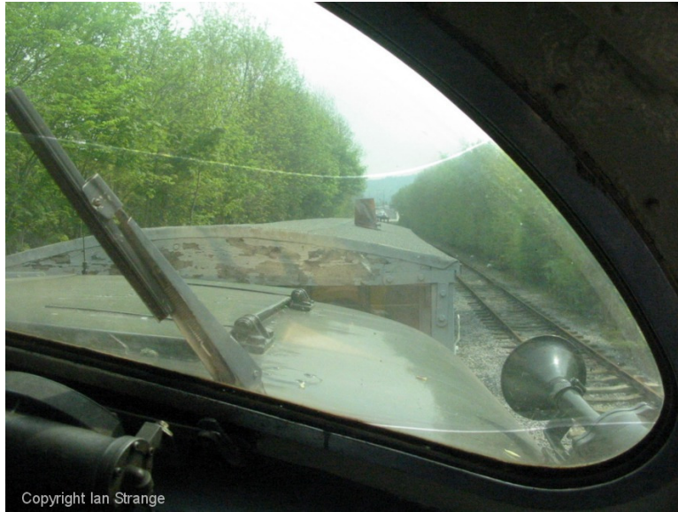
Photos above and below were taken at Matlock before departure (Chris Wayman in rear cab).